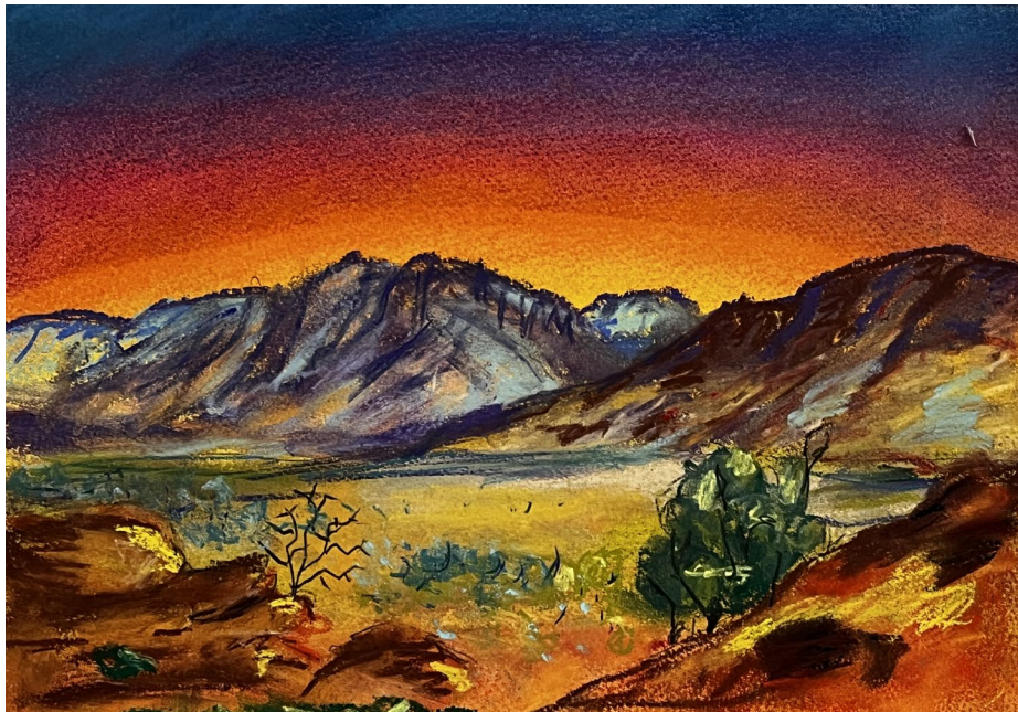
Class 8 art-work – Camel Trek Camp